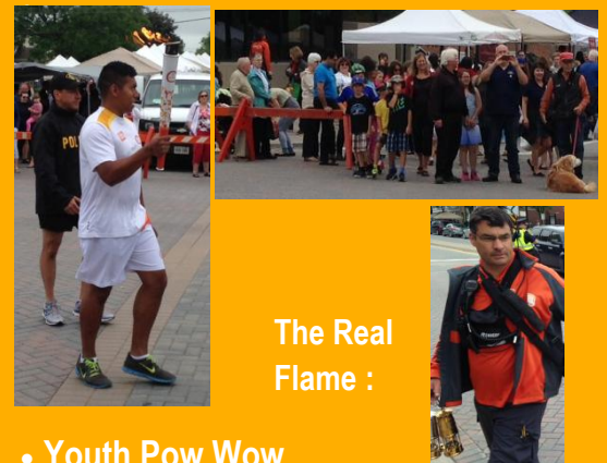
The Real Flame :