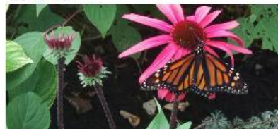
The Healing Wheel renovation/pollinator garden: University of Guelph landscape/architecture students and their professor did projects on how to convert this area to a more user and environmentally friendly area. One of the results is this lovely pollinator garden planted inside The Healing Wheel, by Shelburne high school students.