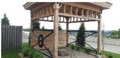
The Pavilion: A meaningful community project initiated by the Rotary Club of Orangeville and built by two Rotary Corporate members, Devonleigh Homes and Whispering Pines Landscaping.

Beverages and appetizers will be served.