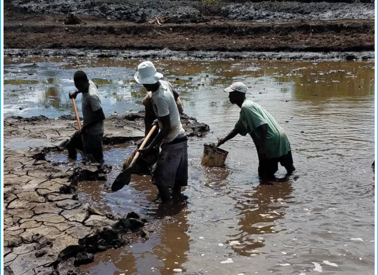
Reminder of how the Fish Pond has been dug - all by hand, and now 7 ft deep!

Work on the chicken coops has started; they are using mud from the Fish Pond excavation to level the land for the Chicken Coops.