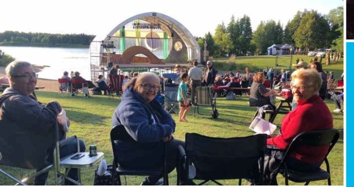
Rotarians and family enjoying the evening!

Our donation of the Ribfest 50/50 Lottery went to Theatre Orangeville in support of the CPOS group and Community Living Dufferin.