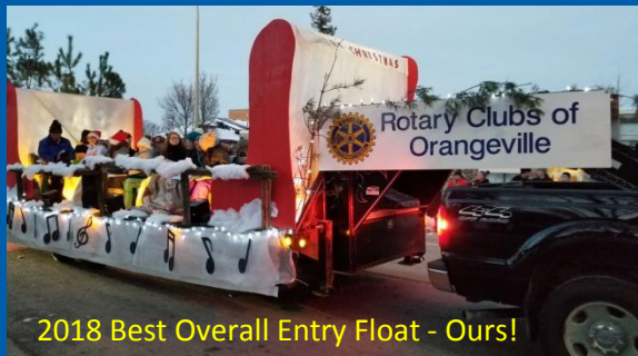
2018 Best Overall Entry Float - Ours!

On Parade Day, we need volunteers to ride on the float and some to walk alongside for safety and to wave to the crowd along the route.