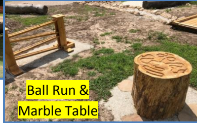
Ball Run & Marble Table