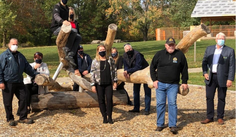
The Team gathered at the Climbing Tree.

And the ribbon was cut at the main entrance to the playground. For Spring, a sign will be erected