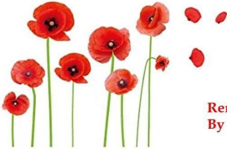
Remembrance Day 2020 By Barbara Moulton