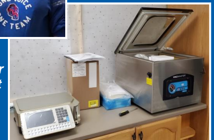
Vacuum Sealer and Ingredient Label Printer