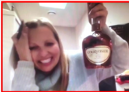
Our Happy Auctioneers Well Done!