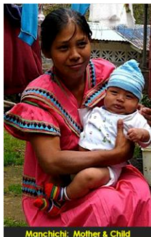
Manchichi: Mother & Child

The donation is subject to the Panama Club completing its application to RI for funding and our donation will not be sent until that is complete. Only then will the funds be sent direct to RI.